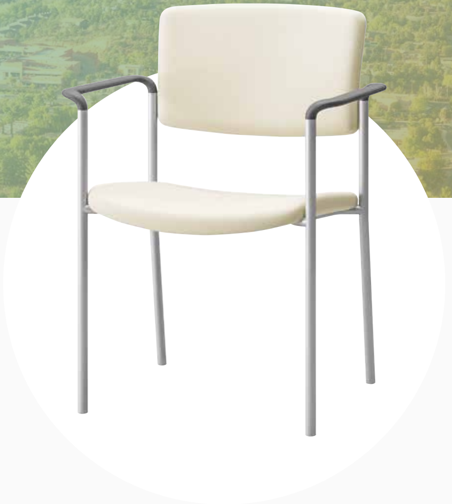
SEDONA STACKING CHAIR