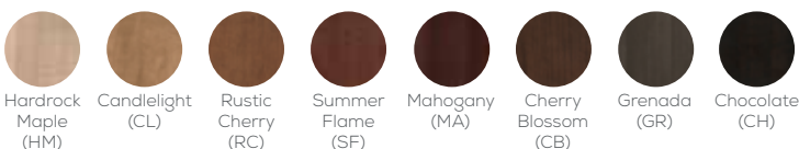
TABLE BASE POWDERCOAT FINISHES