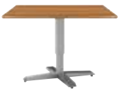
Square height adjustable dining table