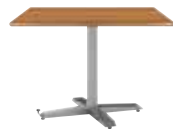
Square fixed height dining table