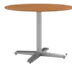
Round fixed height dining table