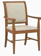
Saltaire dining chair with arms

Width: 26.5 Depth: 24 Height: 37.5 Seat Width: 19 Seat Depth: 18 Seat Height: 19.5 Arm Height: 26